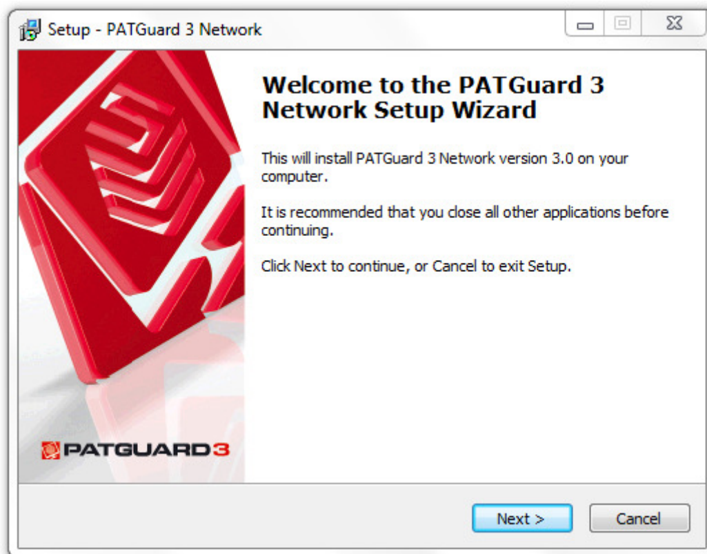
Installation Screen 1

To install PATGuard 3 on a network Workstation, browse to the location specified when you installed on a network Server (See How to Guide 047- Installing on a Network Server). Locate and run the file netsetup.exe to install PATGuard 3 on a network Workstation. Click Next > on the following screen to start the installation process.